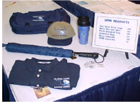
OFMA Products - Top to Bottom: Briefcase, Baseball Cap, Insulated Mug, Umbrella, Pins, Golf Shirt.