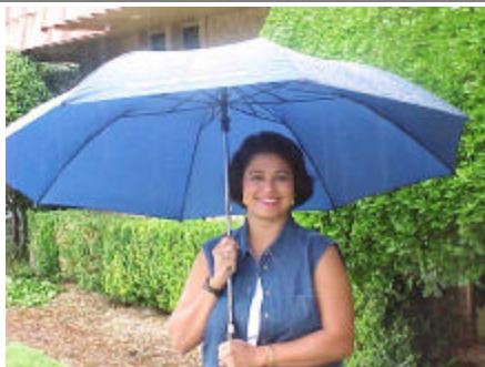
OFMA's Large Umbrella (Model not included)