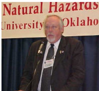
Oklahoma Insurance Commissioner Carroll Fisher addresses Flood Forum

The Oklahoma Flood Forum (sponsored by the National Flood Insurance Program, The City of Tulsa, and OFMA), held in conjunction with the Severe Weather Symposium at the Tulsa Civic Center on April 4 th , attracted over 200 real estate and insurance agents, lenders, floodplain managers and public officials.