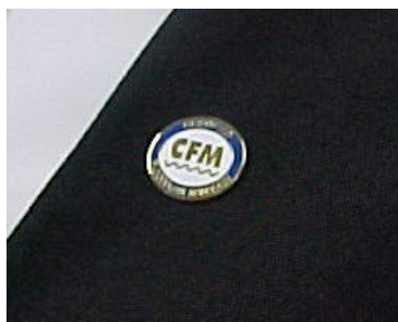
Certified Floodplain Managers Lapel Pin (Only Available to CFM's)