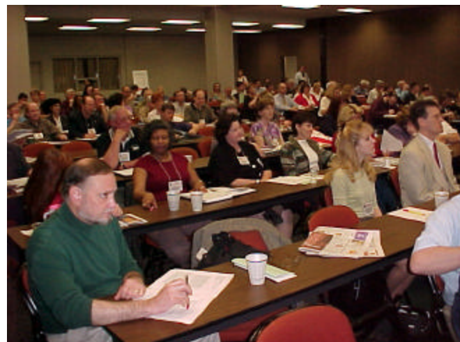
The Flood Forum was attended by real estate and insurance agents, public officials and floodplain managers.